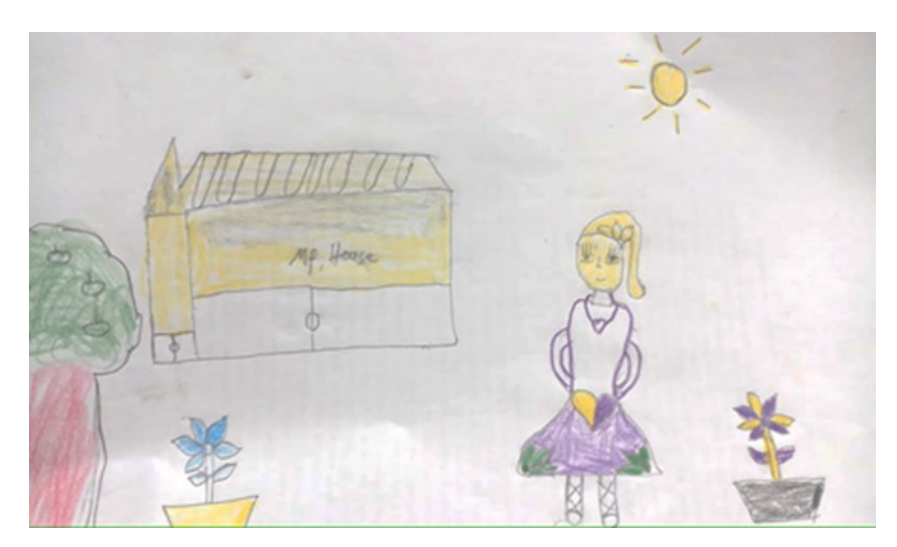
Figure 2 - The CLTB's concept of a healthy child